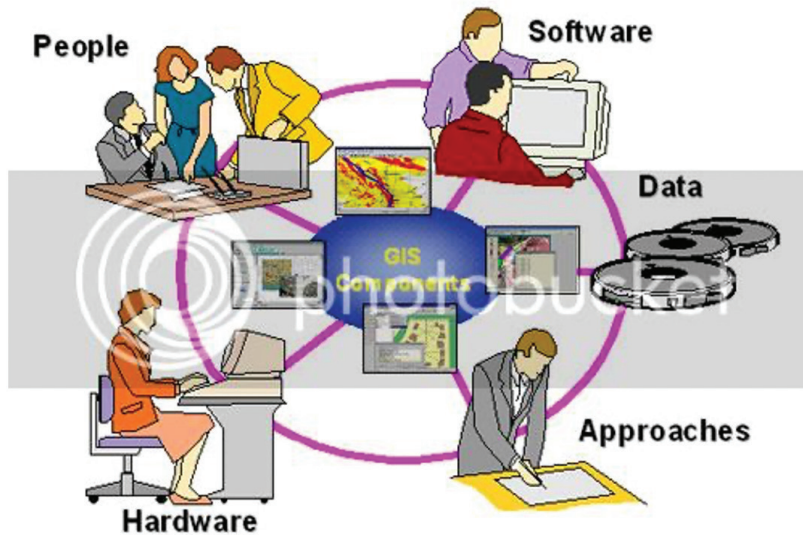
Fig. 1: Geographic Information System GIS

A well-organized system of hardware, software, databases, and people was created to collect, archive, update, analyze, model, and present various types of geographical data to address planning and management issues.